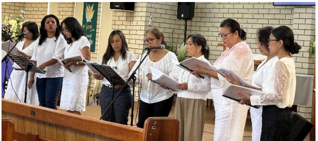
Choir from last week's Indonesian service