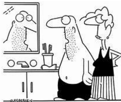
"Have you noticed that my reflection is aging a lot faster than I am?"