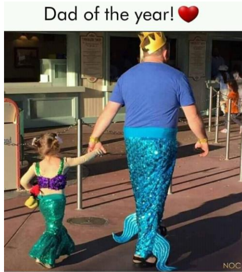
Dad of the year! ❤️