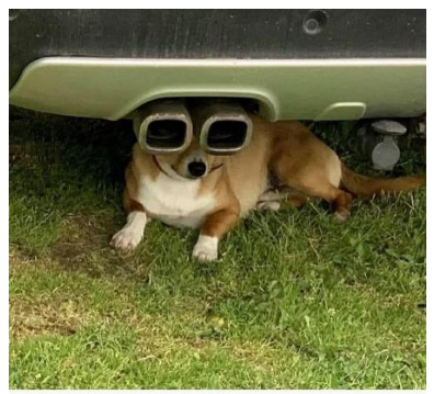
that dog looks exhausted

My friend Jack claims that he can communicate with vegetables.