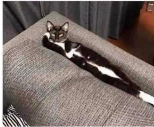
My remote watching me look for it

FACEBOOK.COM/OFF THE LEASH DAILY DOG CARTOONS