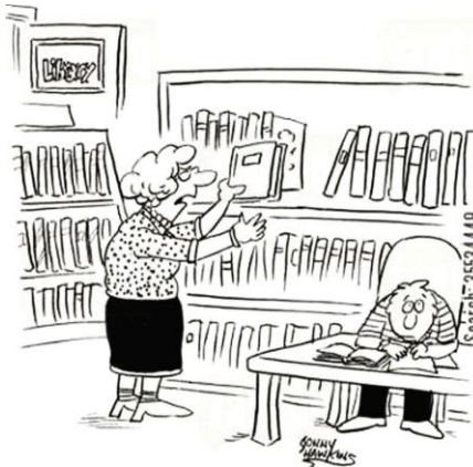
"Who is putting all the Math books in the Horror section?"