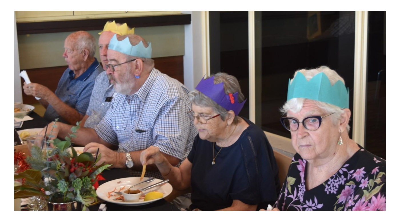
The Herald will probably be having the usual December -January recess.